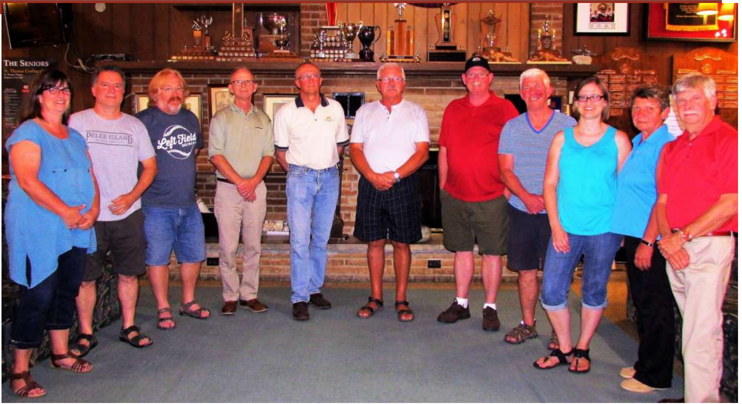
Your 2017-18 Board of Directors